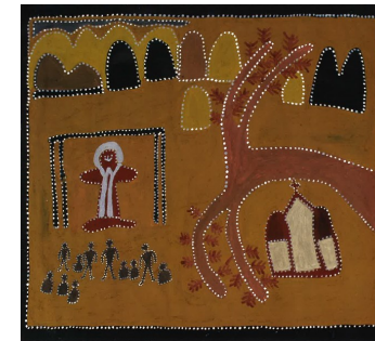
Peace to this house and all who dwell within

"Peace to this house and all who dwell within." In our busy lives, we are often bombarded with competing priorities, distractions, worries and concerns about ourselves and others, which can cause us to forget to take the time to stop, look around, reflect and look for our peace in our lives. Our strong connection to culture and land helps us see the beauty in our world and by sharing this appreciation we are helping share God's love. The message that the team would like to give you, is to go and reflect, make time to look for your inner peace in your busy life, and celebrate together with your families, friends and the wider community God's message of peace and love for all.